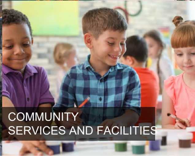
COMMUNITY SERVICES AND FACILITIES