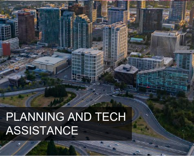
PLANNING AND TECH ASSISTANCE