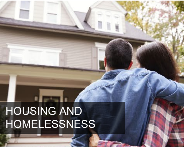
HOUSING AND HOMELESSNESS