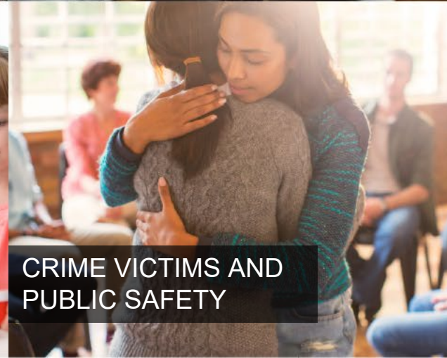
CRIME VICTIMS AND PUBLIC SAFETY