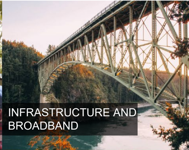
INFRASTRUCTURE AND BROADBAND