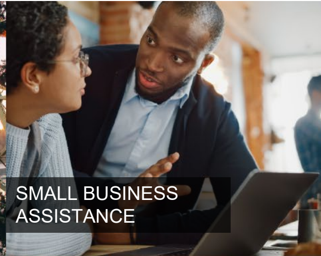
SMALL BUSINESS ASSISTANCE